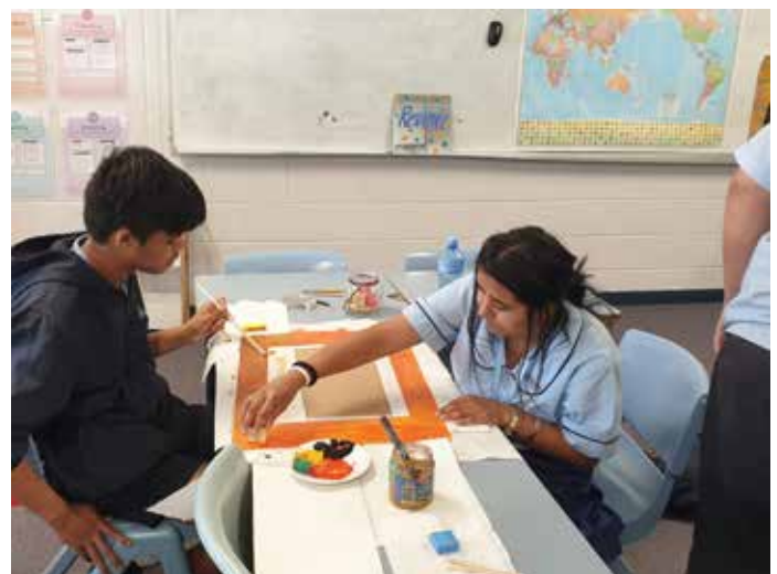
3 Bridges Community Program