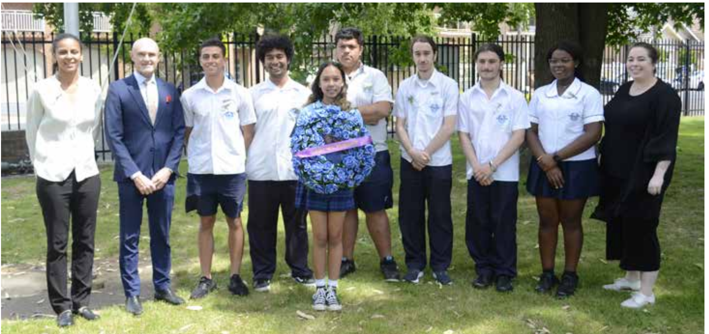
Remembrance Day Team