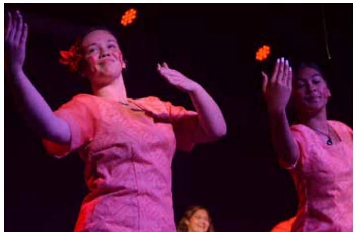
Performers at Big Night Out XV