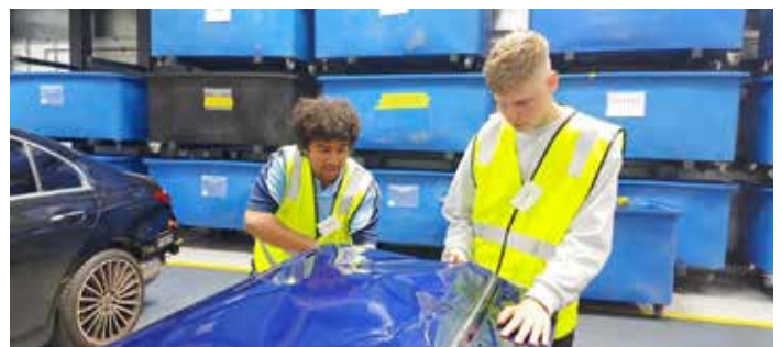
Students at Perfect Autobody Excursion