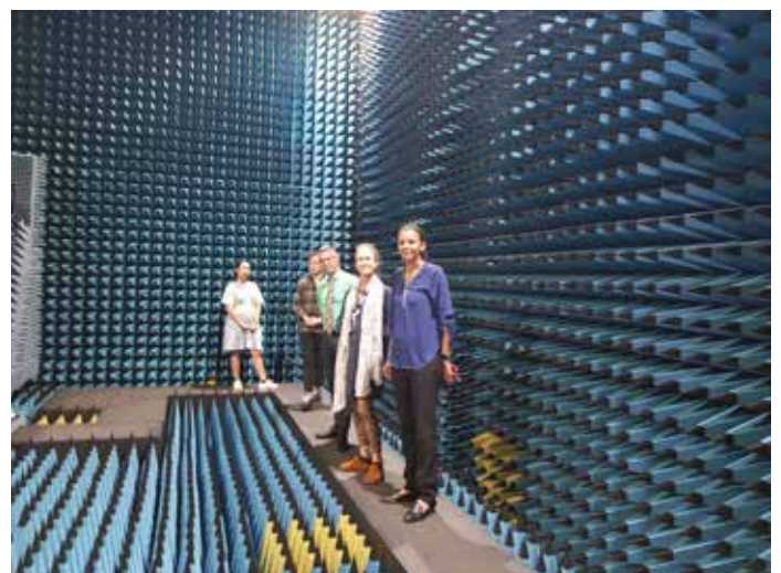
Teacher Excursion to the Nokia/UTS Tech Lab