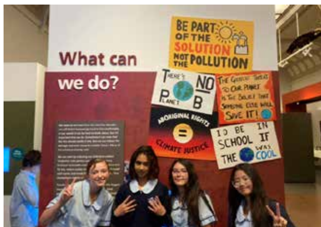
Year 7 Students at the Australian Museum

A wonderful experience, with an excellent group of kids who all behaved in a respectful manner, and engaged in all aspects of the excursion. Thank you to all teachers and students who attended this excellent excursion.