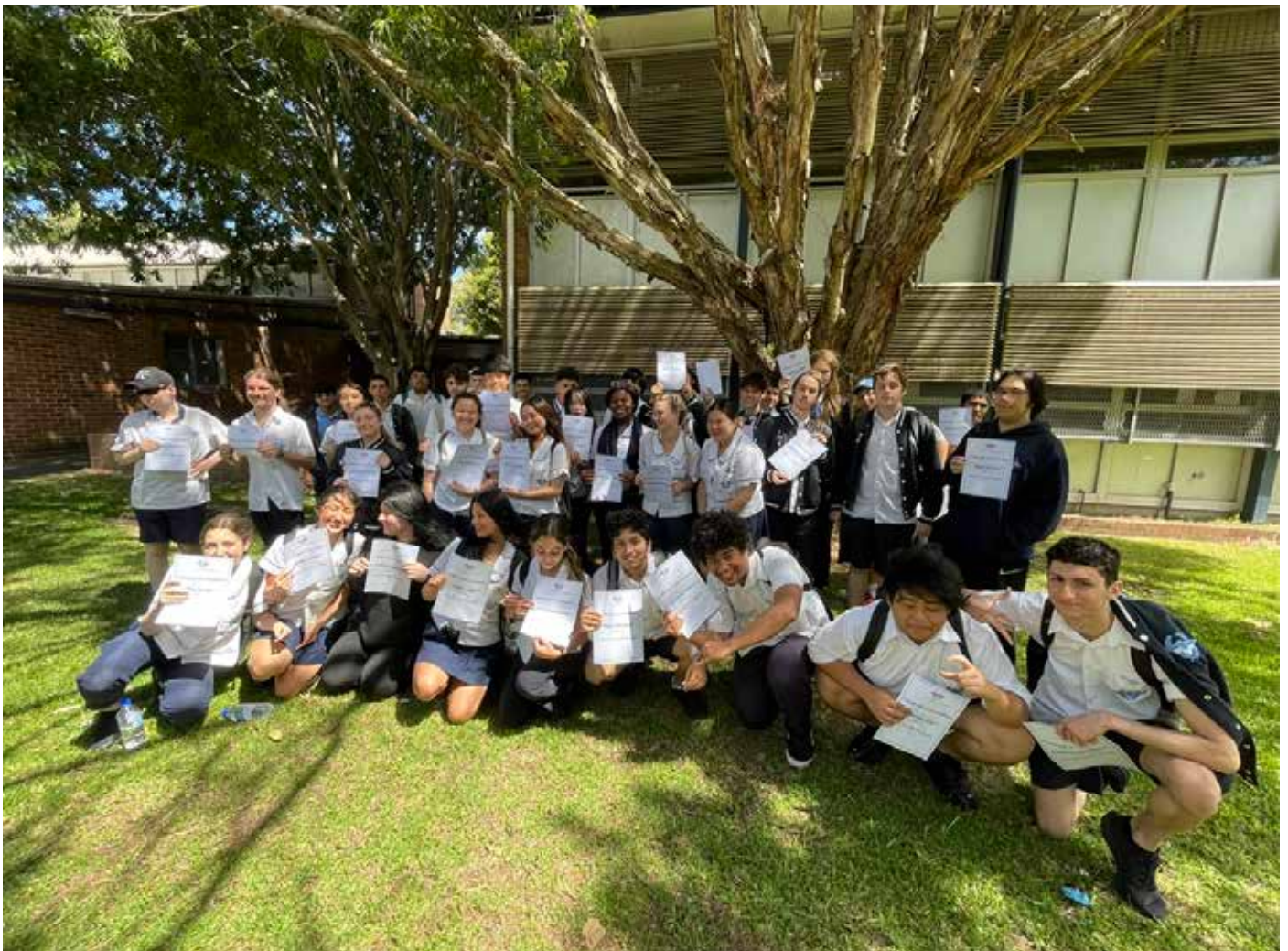
Life Ready Graduates 2022