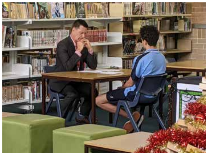
Year 10 students engaged in their Mock Job Interviews