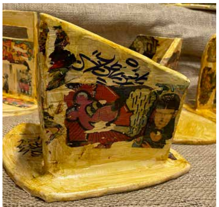
Art Exhibition at Big Night Out XV