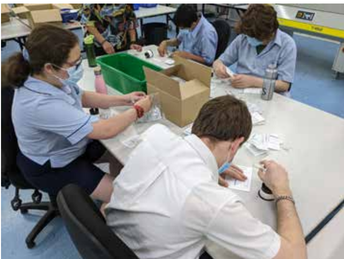
Support Unit Students at Work Experience