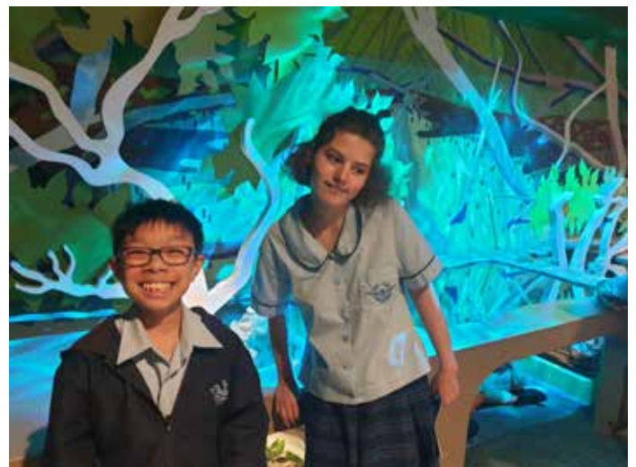
Year 7 Students at the AIME IMAGI-NATION Factory Excursion