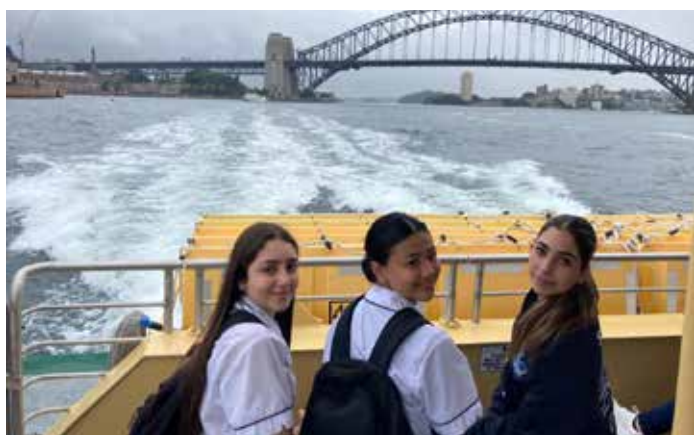
Year 11 Business Studies Excursion to Taronga Zoo