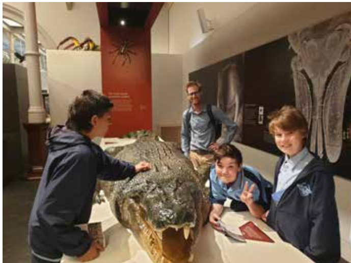
Year 7 Students at the Australian Museum

Year 7 had an incredible opportunity to learn about Australian history and culture through guided talks, small group exploration of artefacts and hands-on activities on our visit to the Australian Museum this term. Students enjoyed the interactive Burra learning space, joining a fascinating learning journey through Country, at this exciting new state-of-the-art play space that immersed them in Western science and First Nations knowledge.