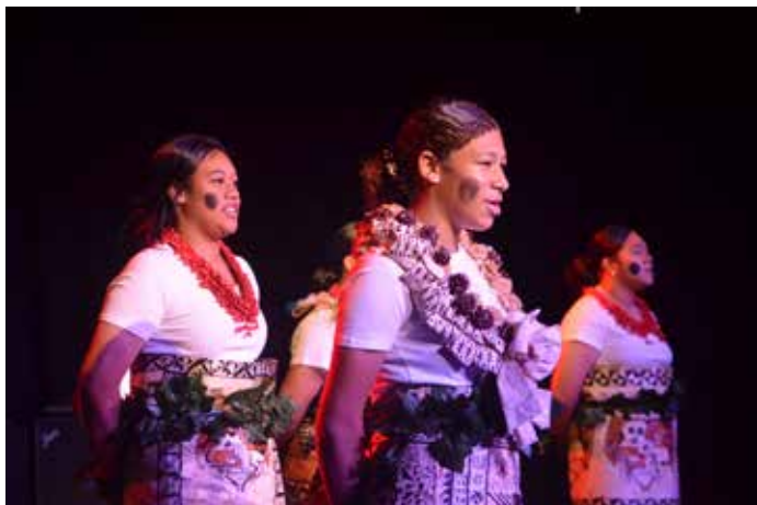
Performers at Big Night Out XV