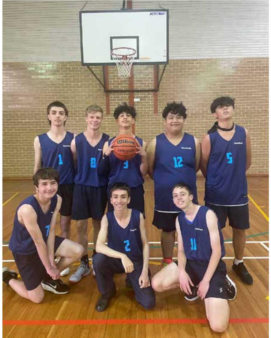
JJCMHS 16 Boys' Basketball Team

years boys only played the first half of their game until the gala day was cut short due to injury. Their school spirit was evident, and it was a shame they didn't get to show all of the hard work they put in leading up to the day. We are so proud of our rugby league teams and our basketball team and look forward to more gala days next year.