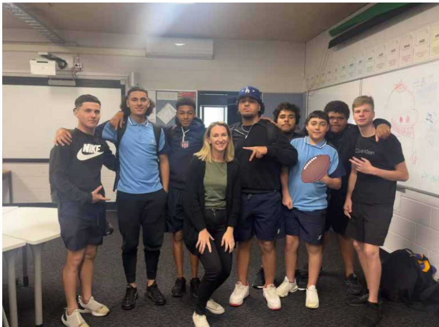
EVET Graduates 2022

During our sessions each week the boys had to prepare all the components of the sports session; set a session plan, create an equipment list, review and discuss a risk assessment, do a practice run with our class and understand reflection and feedback.