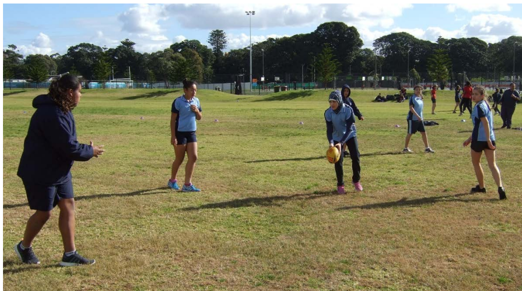
The girls' touch football team playing against Matraville Sports HS