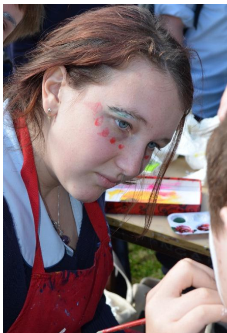
Photos from NAIDOC Week